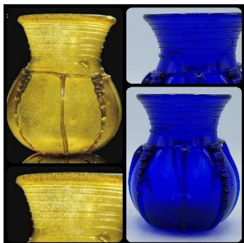
Extant piece, left, Celera's reproduction, right.